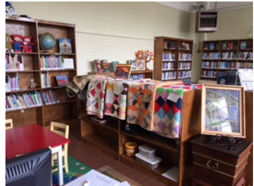
These quilts were on display at the Arts Center.