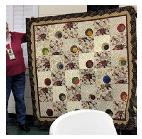
Sherry Hodge Circling of the Birds