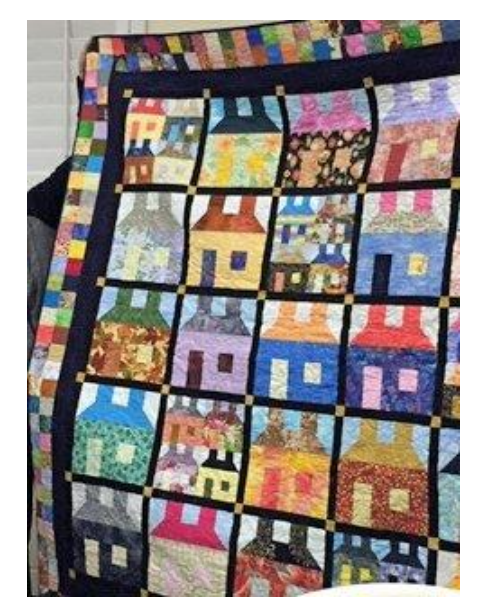
Gerry White Vintage Village