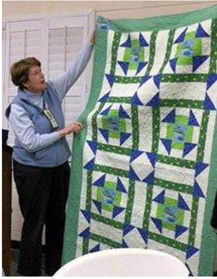
Sandy Erwin Read It-Read It Pillow & Quilt