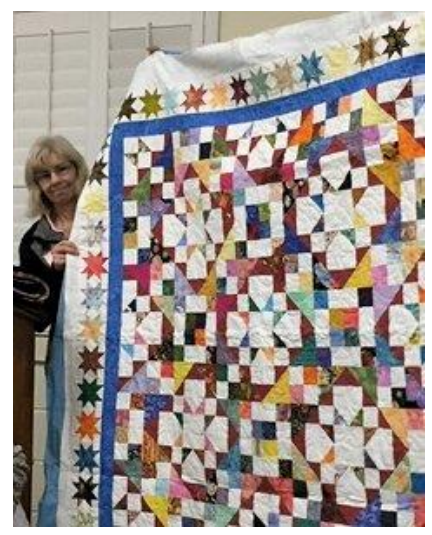
Gerry White Scrap Quilt