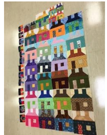
Vintage Village workshop