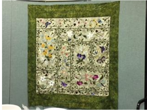
Connie Mock Simple Gifts