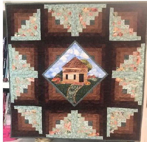
Quilt ready for Habitat for Humanity dedication in June