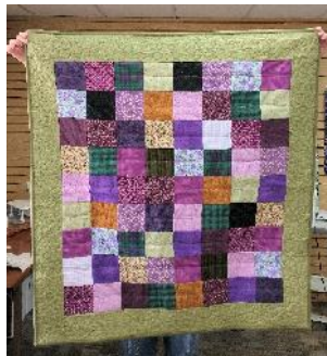
A couple of donated charity quilts