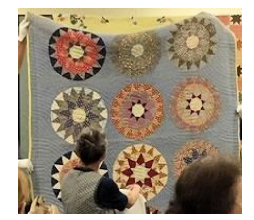
Page 4 of 7