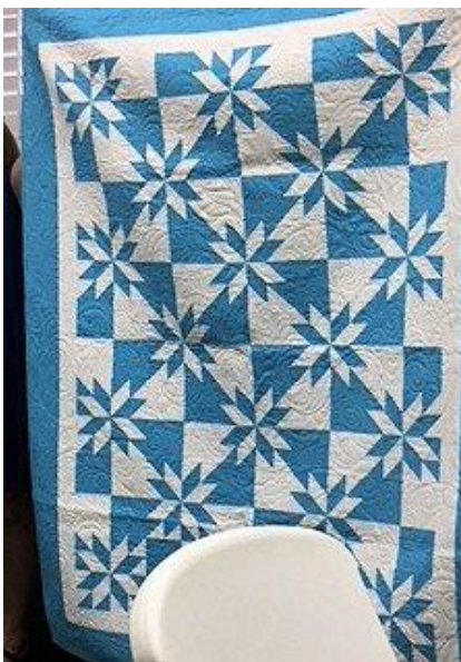
Lamoyne Star lap quilt