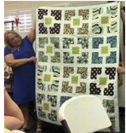
Hole in the Wall lap quilt