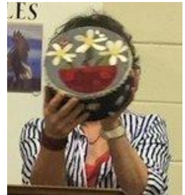
Lucy Bureau Fabric box