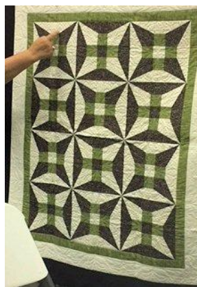
Opposites Attract pattern in three different layouts.