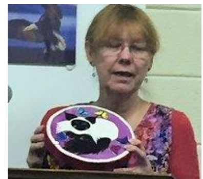
Rori Bebko Fabric box