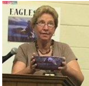
Barb Saporito Fabric bowl