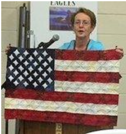
Joyce Sinclair Cathedral Window flag