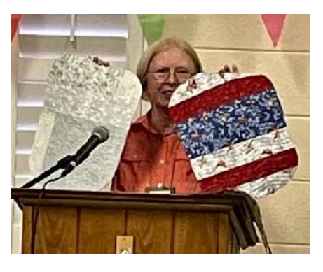
Show 'n Tell