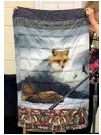
Marolyn Floyd Weighted blanket