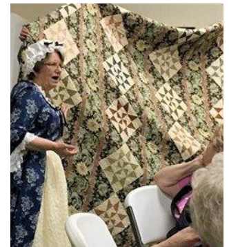
Martha Washington blocks