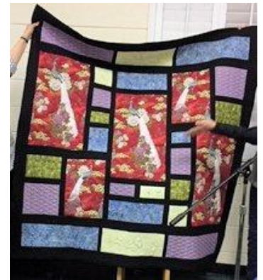
Gerry White Peacock fabric quilt