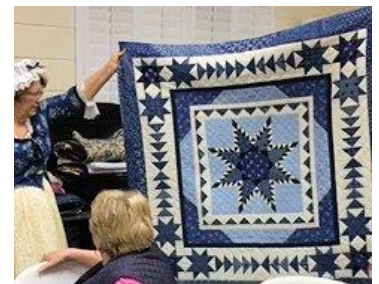
Indigo fabric quilt