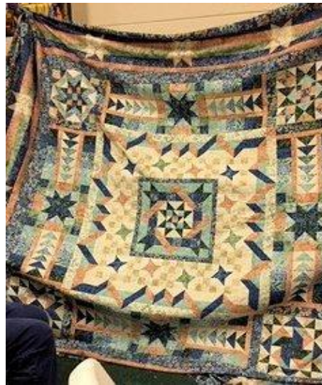
Liz Nolan Block of the Month