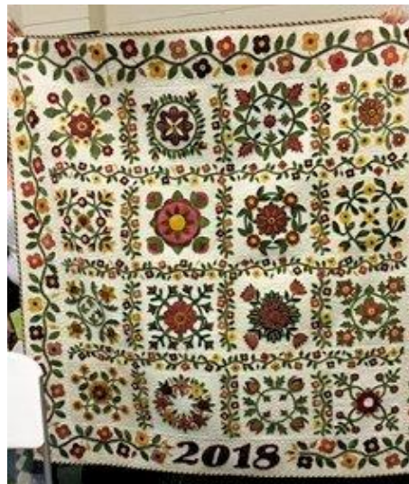
Sherry Hodge Wool quilt