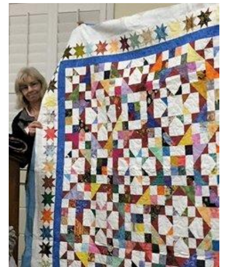
Gerry White Scrap Quilt