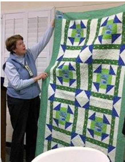
Sandy Erwin Read It-Read It Pillow & Quilt