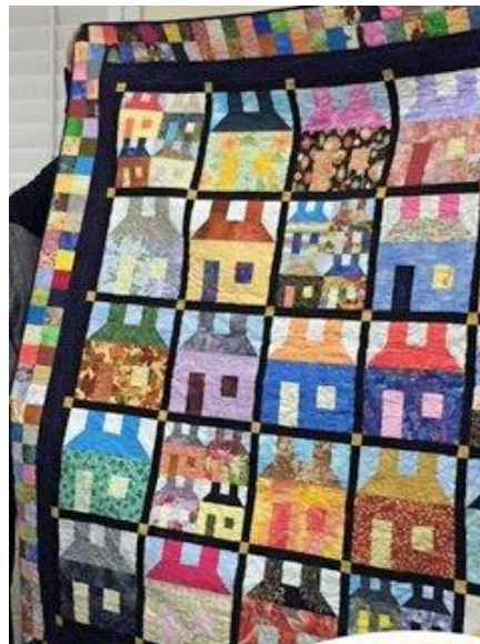
Gerry White Vintage Village