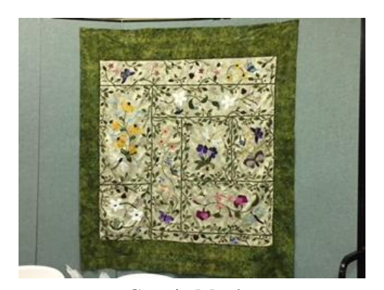
Connie Mock Simple Gifts