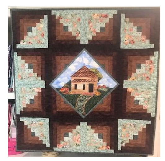
Quilt ready for Habitat for Humanity dedication in June