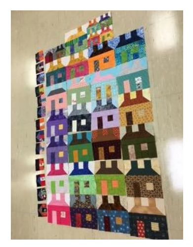
Vintage Village workshop